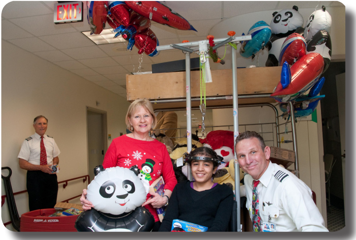
This page shows a variety of visits conducted by the PFK members in DFW. This group gets a large number of volunteers to help spread cheer throughout the area.