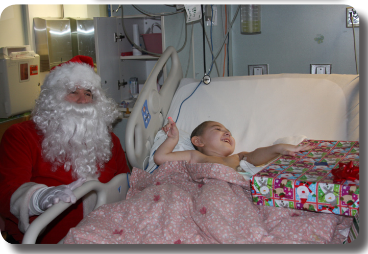
Above, ANC PFK volunteers brightened the day for many children during their 2012 holiday visits to 3 hospitals and a homeless shelter.