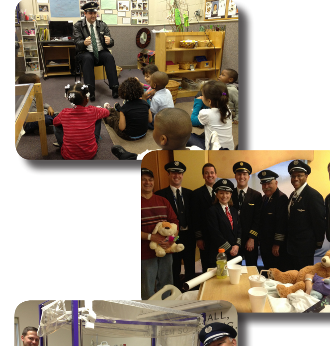
From IND school and hospital visits...

Dozens of smiling faces: Take a look at the attached pics and see the smiling faces of courage on the kid's faces, (and the parents) as they cope with difficult circumstances.