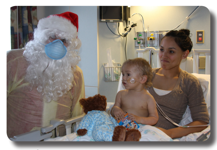
Above, "Santa" donned sterile garb to visit this young patient in ANC during the PFK holiday visits.

The ANC PFK group had another very successful year with hospital visits. Over 20 uniformed Fed Ex pilots, spouses, family members and "Santa" got together on December 18th for visits to two local hospitals, Providence and Alaska Native. In addition, a smaller group gathered to deliver gifts to Mat-Su Regional Medical Center. The group also delivered wrapped gifts to the local Clare House emergency homeless shelter for women and children. These dedicated volunteers distributed over 200 wrapped gifts, parent gift bags, candy canes, chocolates and loads of Christmas cheer throughout their visits. They were also joined by one of the FedEx pilots and his singing quartet who entertained throughout the day. The response from those visited was heartwarming and the group agreed that it was another very successful event.