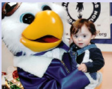
PFK Mascot, Capt.Baldy