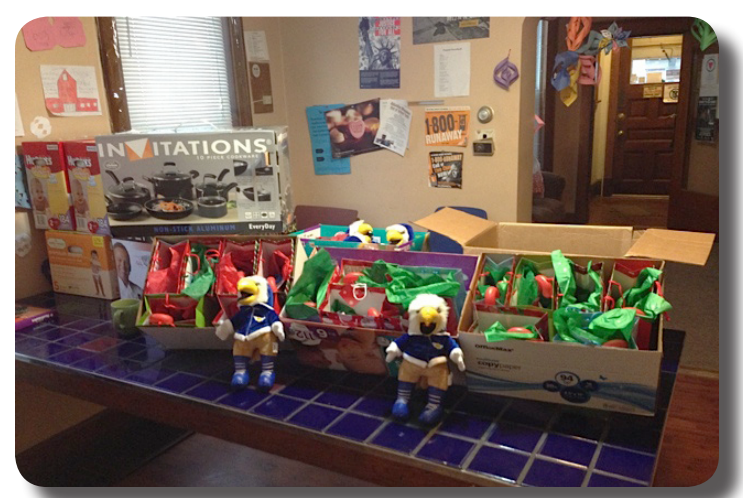
Above, gifts are ready for distribution at two MKE area events. Although the pilot group was unable to attend due to weather, the events went on as planned.

The second event was at the Sojourner Truth House, which is a domestic violence shelter that provides a secure environment from violence for women and children. There were 23 kids staying at this shelter with their mothers and each of them received a Pillow Pet. Staff members said that all of the kids were elated about receiving the Pillow Pets. Although the pilot group wasn't able to attend, the holiday events were still a big success and the group looks forward to more participation next year.