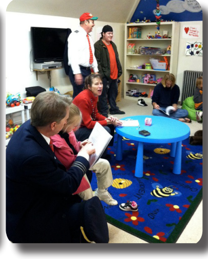
This page, PFK members from DEN visited five shelters around the Denver area, enriching the holidays for many children who loved the visits.