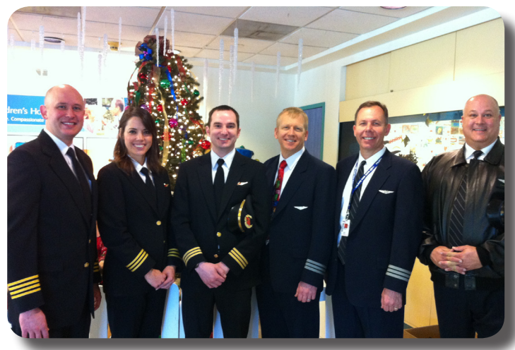
Above, PFK volunteers from ORD visited young patients at Advocate Christ Children's Hospital.

December 13th was a special day at Advocate Christ Children's Hospital in Chicago, as this was the day that an enthusiastic group of PFK volunteers delivered toys and holiday cheer to hospitalized children at that facility. The smiling faces of the pilot group (below) is indicative of the wonderful time everyone had.