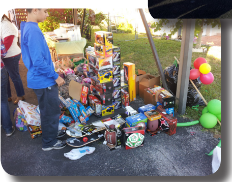
Above and right, a happy group of youngsters received gifts and a welcomed visit from PFK volunteers at Our Dominican Sisters in Hialeah. FL

Dear Pilots for Kids, Thank you so much for the Duplos. They really cheered me up and gave me something funto do when I was stuck in bed. Thankyou!